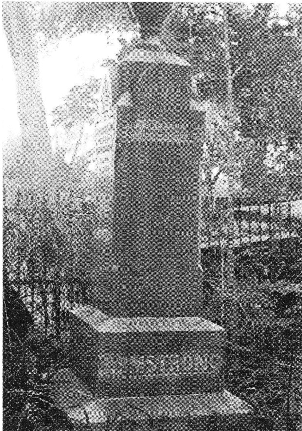
Armstrong Tombstone (Pg. 51)

WOOD 39,40,152,157 WOODALD 62 WOODALL 2,10,12,14,15,24,27,28, 30,32,45,49,61,64-68, 71-73,90,110,131,151,165, 188,190 WOODBURN 68 WOOTERS 11 WORRELL 197 WRIGHT 30,93,97,173,194 WYATT 164,173 WYTHE 139 YARD 103 YATES 184 YELLOWDY 105 YOUNG 91,94